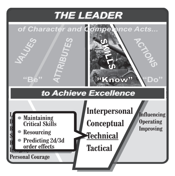
Figure 6-3. Organizational Leader Skills—Technical

6-28. The external responsibilities of organizational leaders are greater than those of direct leaders, both vertically and horizontally. Their organizations have more levels than direct-level organizations and, depending on the organization's role, command interest may reach to the CINC or national command authority. There are more requirements to coordinate with other organizations, which may include agencies outside the Department of Defense (DOD). To make full use of their organizations' capabilities, organizational leaders must continue to master technical skills outside their original area of expertise.