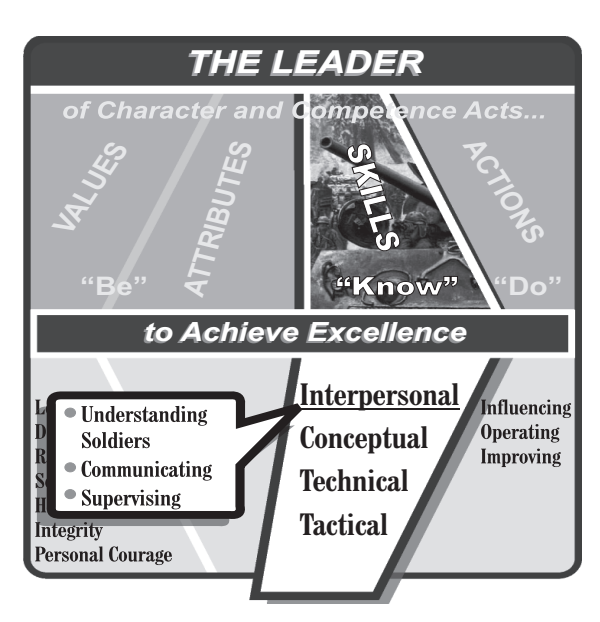
Figure 6-1. Organizational Leader Skills— Interpersonal