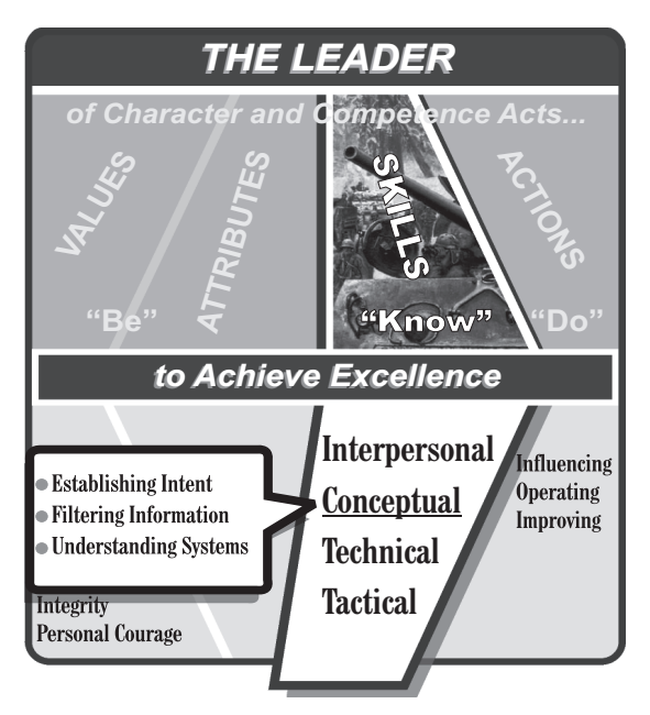
Figure 6-2. Organizational Leader Skills— Conceptual

6-15. The complexity of the organizational leader's environment requires patience, the willingness to think before acting. Furthermore, the importance of conceptual and analytical skills increases as an organizational leader moves into positions of greater responsibility. Organizational environments with multiple dimensions offer problems that become more abstract, complex, and uncertain.