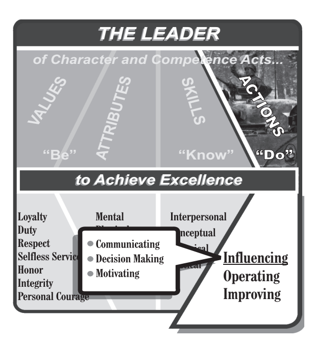
Figure 6-5. Organizational Leader Actions— Influencing

6-43. The chain of command provides the initial tool for getting the word out from, and returning feedback to, the commander. In training, commanders must constantly improve its functioning. They must stress it in training situations, pushing it to the point of failure. Combat training centers (CTCs) offer tremendous opportunities to exercise and assess the chain of command in their